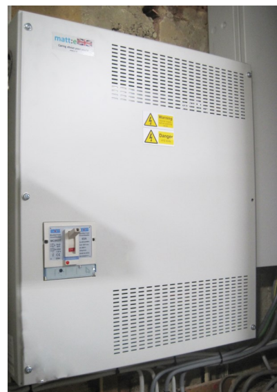
Model shown typical installed B3 063-1