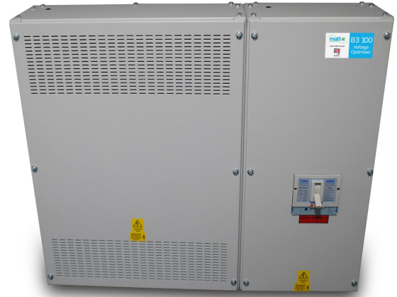
Model shown B3 100-1