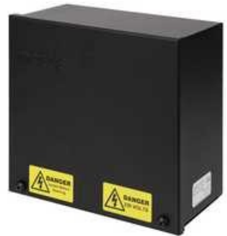
Unit also available in white

The SP-EVCP-TC from matt:e incorporates our unique monitoring device that disconnects all poles including CPC in the event of a broken Neutral fault in line with Regulation 722.411.4.1(iv) and has the additional functionality for load curtailment in line with Regulation 722.311.201, isolating the charge point from the supply once the house consumption rises above the preset limit and automatically restores the power to the charge point when the load falls back within a satisfactory level.